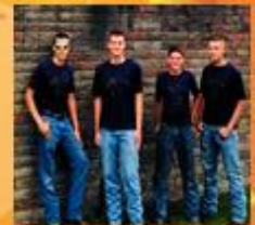
Them Roten Boys (Bluegrass Gospel)

Teays Valley Presbyterian Church 5339 Teays Valley Road Scott Depot WV 25560